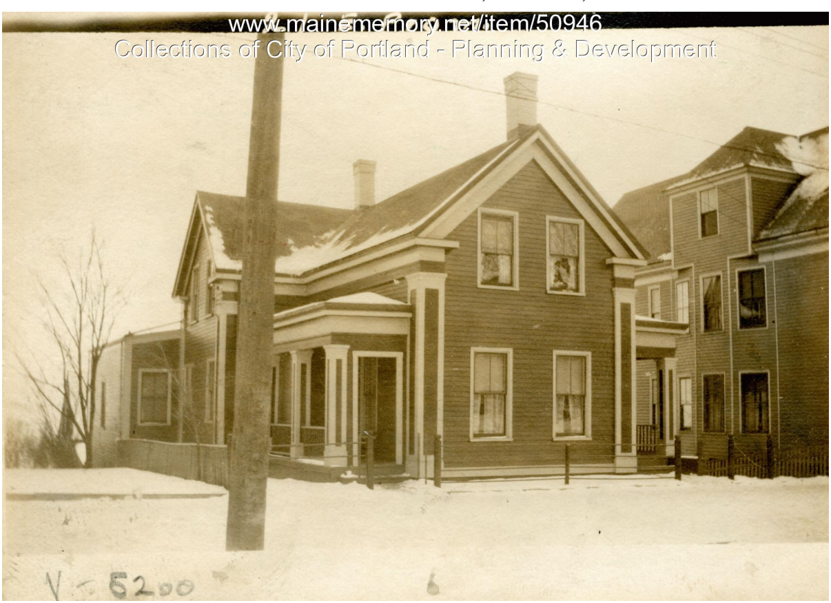
1924 Portland Tax Records: 21-23 Eastern Promanade, Portland, 1924