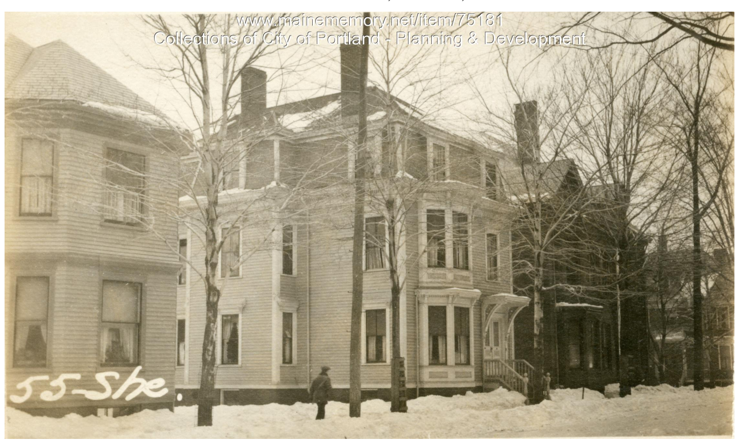
1924 Portland Tax Records: 51-55 Sherman Street, Portland, 1924