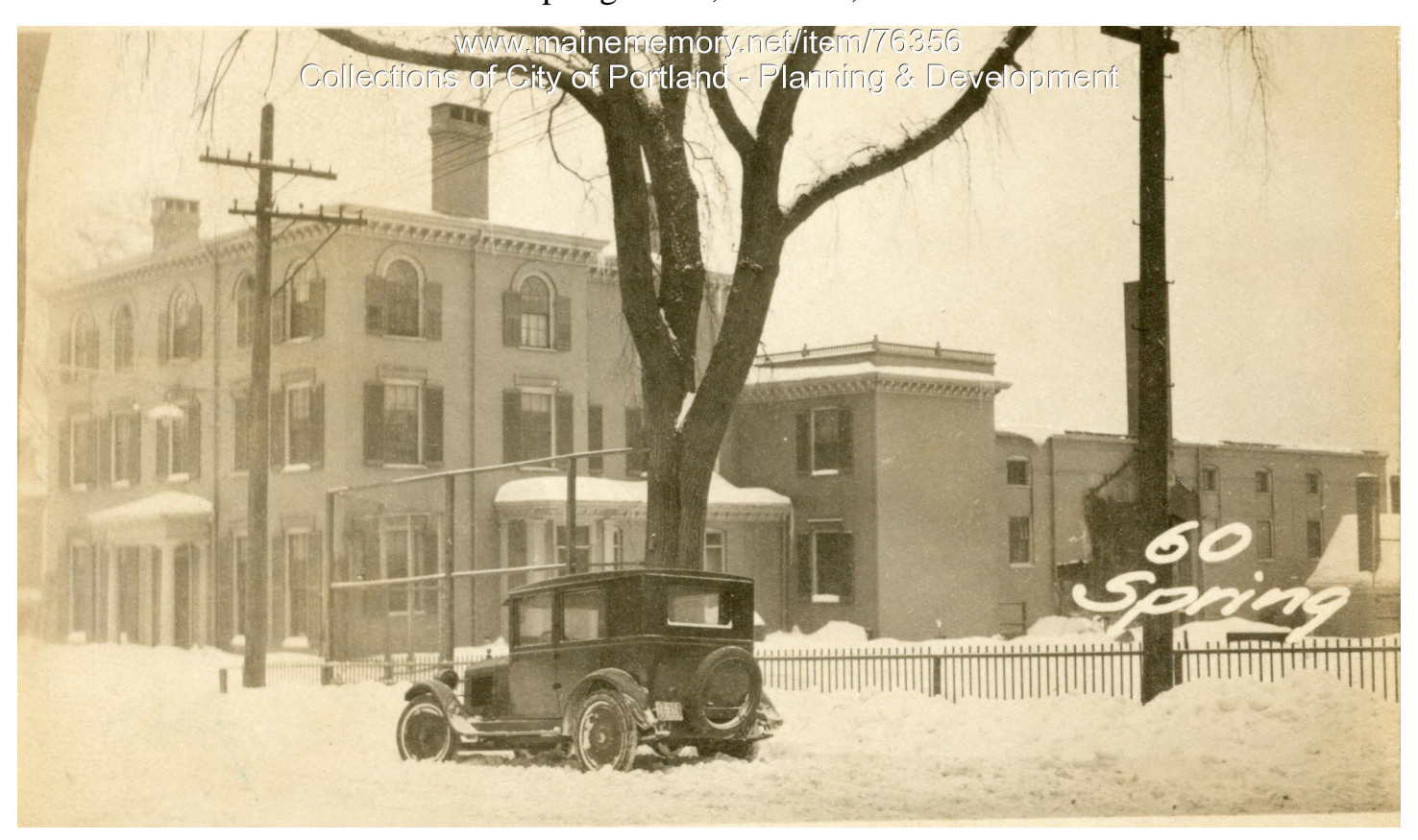
1924 Portland Tax Records: 56-70 Spring Street, Portland, 1924