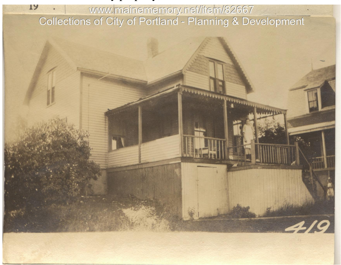
1924 Portland Tax Records: Varney property, E. Side Pleasant Avenue, Peaks Island, Portland, 1924