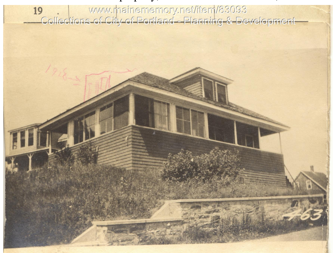
1924 Portland Tax Records: Charles property, W. Side Seashore Avenue, Peaks Island, Portland, 1924