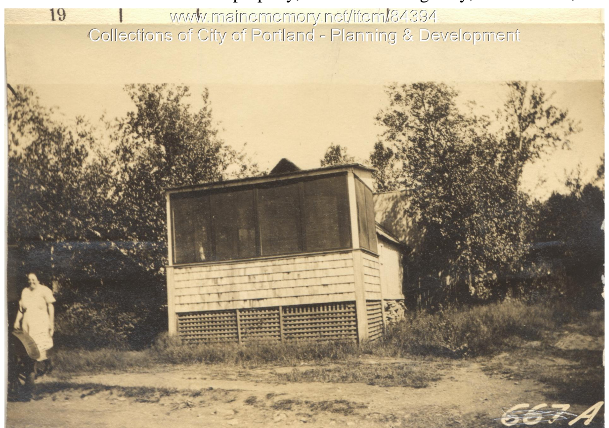
1924 Portland Tax Records: Donovan property, N. Side Winding Way, Peaks Island, Portland, 1924