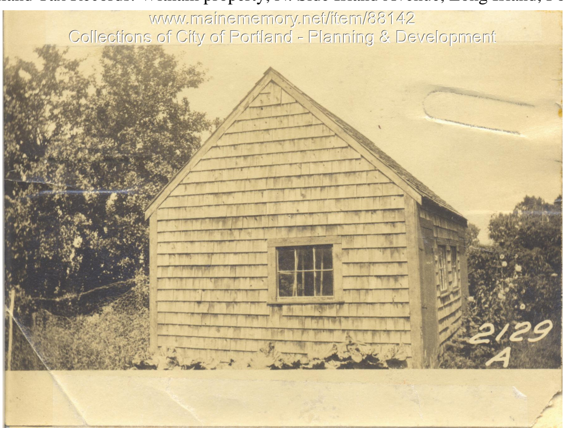
1924 Portland Tax Records: Witham property, N. Side Island Avenue, Long Island, Portland, 1924