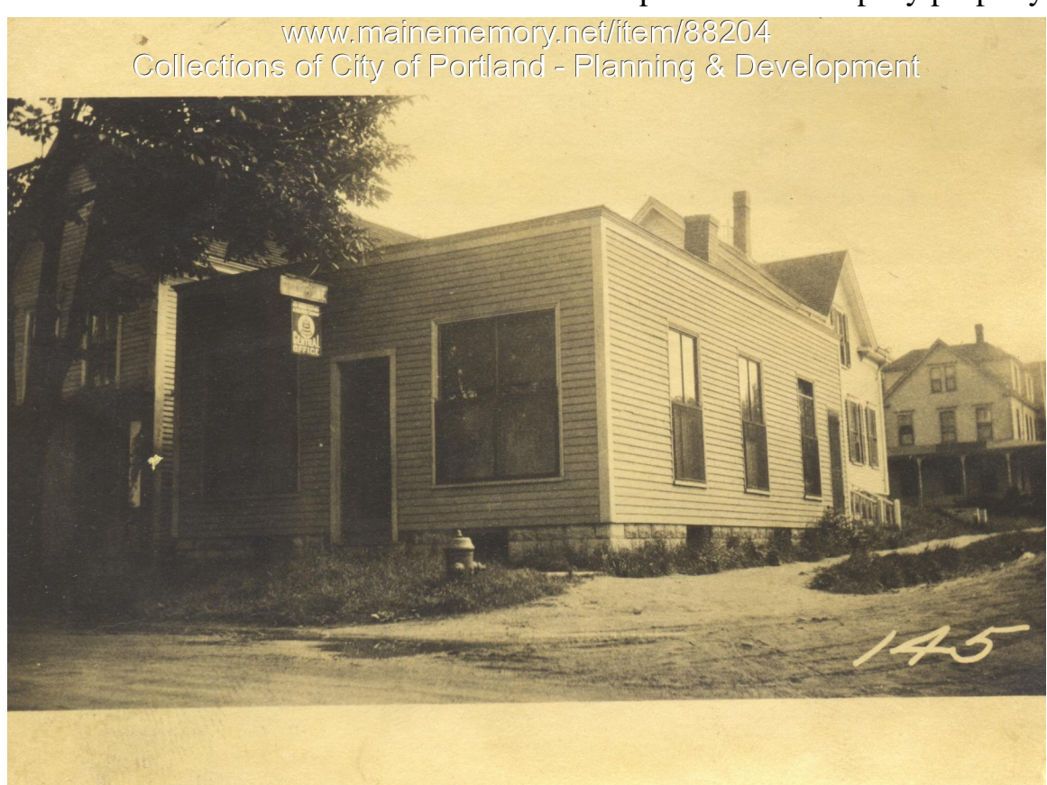
1924 Portland Tax Records: Portland Investment and Improvement Company property, E. Side Island

Owner: Portland Investment and Improvement Company