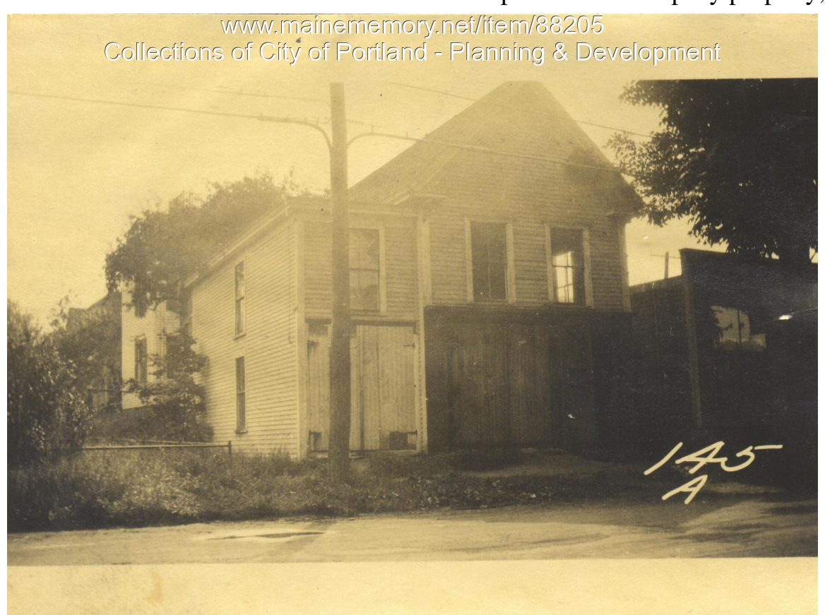
1924 Portland Tax Records: Portland Investment and Improvement Company property, E. Side Island

Owner: Portland Investment and Improvement Company Address: E. Side Island Avenue, Peaks Island, Portland, Maine