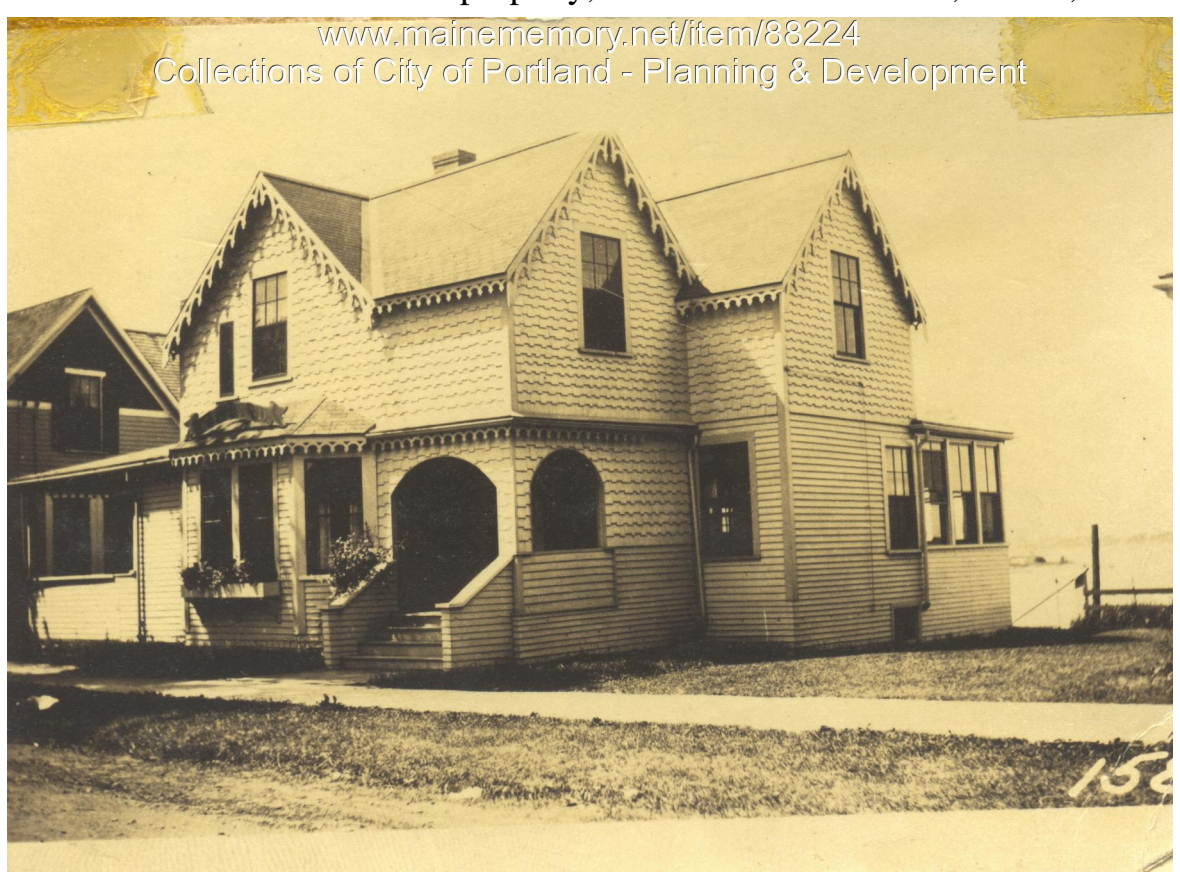
1924 Portland Tax Records: Miltimore property, W. Side Island Avenue, Lot 93, Peaks Island, Portland