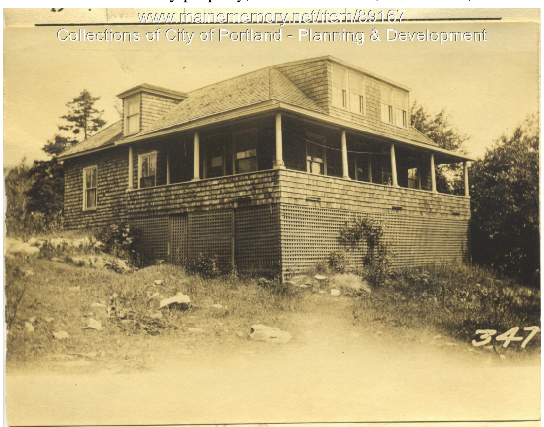
1924 Portland Tax Records: Penley property, N. Side A Street, Part Lot 29, Peaks Island, Portland, 192