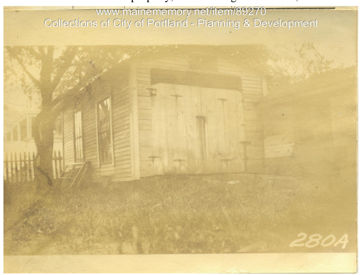
1924 Portland Tax Records: Barbour property, S. Side Ledgewood Road, Peaks Island, Portland, 1924