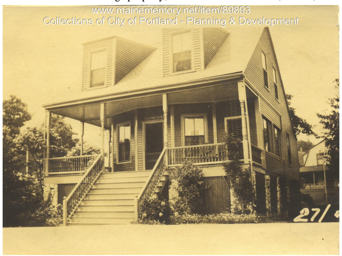
1924 Portland Tax Records: Skillings property, S. Side Crescent Avenue, Lot 26, Peaks Island, Portland