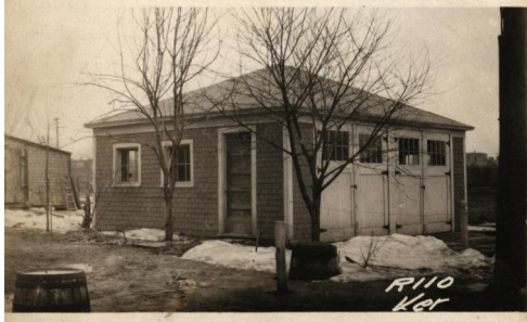
Fowler-Higgins 4/27/25 (Remarks on other Side) 3074